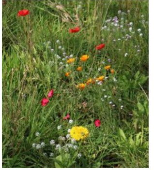
Good for butterflies and other insects

be installed around Astley Village. We would like your suggestions as to where benches might be placed. Please let us know by emailing the Parish Council at clerk@avpc.org. When uk.